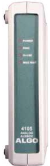
4105 Front Panel View