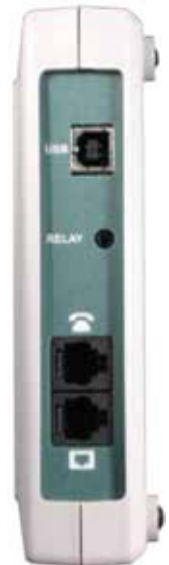
4105 Back Panel View